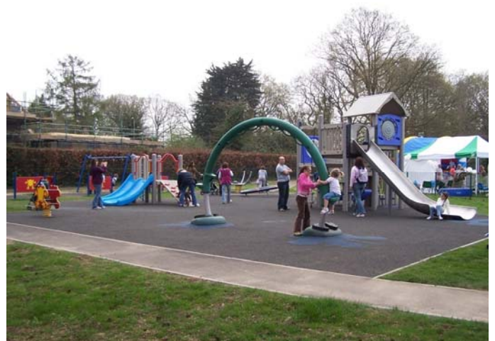
Local children gave their seal of approval