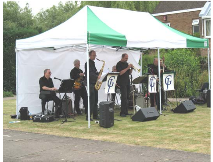
The wonderful Gentle Jazz